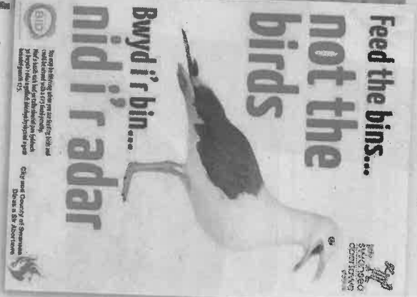
A poster on a bin in Swansea.