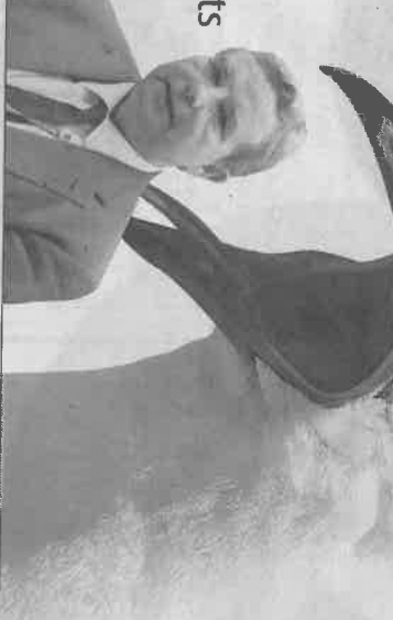
- Dr Dai Lloyd, Plaid Cymru AM for South Wales West

"The Minister will look at the different approaches at the different approaches that local authorities are taking to address this issue."